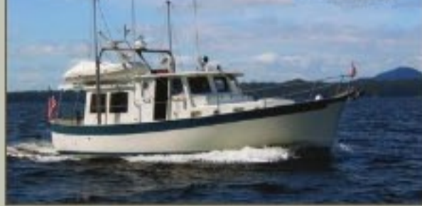
40' Willard Pilothouse 1984 "Quest" $149,999.