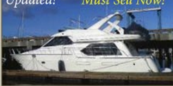
Updated! Must Sell Now!