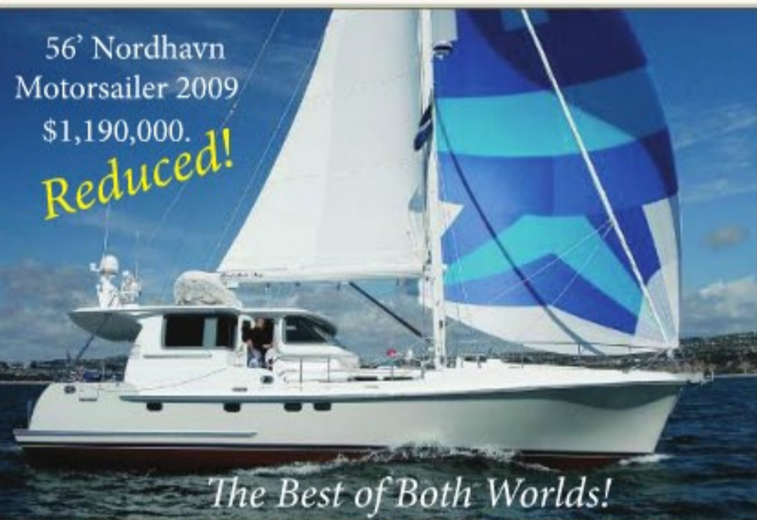
The Best of Both Worlds!

See Us To Make Your Boating Dreams Come True!