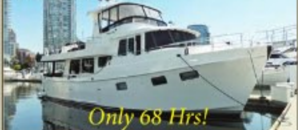
Only 68 Hrs!